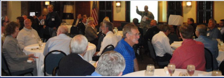
Savannah SAME Post members eat lunch and get ready for the April meeting.